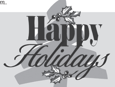
This event is free to honored guests, CCTLA members, and one guest per invitee

You are cordially invited to the CCTCA Annual Meeting & Holiday Reception at Sofia Restaurant, 815 11th Street, Sacramento Thursday, December 13 — 5:30. to 7:30 p.m.